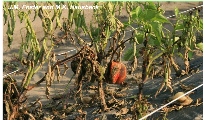
Foliar blight, fruit rot, and stem lesion symptoms.

Foliar applications of fungicides directed at the base of the pepper plant have offered only limited protection from crown rot. Apply foliar sprays using ample water volumes to achieve good coverage. Be sure to apply the fungicide before and after a period of rainfall expected to exceed ½ inch. Some products have been labeled for drip or drench applications.