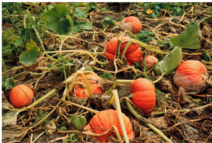
Wilted vines and sporulating winter squash fruits.

This material is based upon work that is supported by the National Institute of Food and Agriculture, U.S. Department of Agriculture (2020-51181-32139) and MSU AgBioResearch Project GREEN (GR22-039).