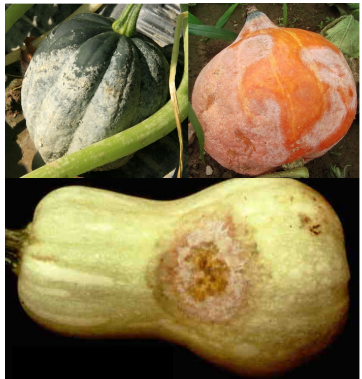
White "powdered sugar" Phytophthora spores and lesions on fruits of acorn squash (top left), processing squash 'Golden Delicious' (top right) and butternut squash (bottom).

Remember that the pesticide label is the legal document on pesticide use. Read the label and follow all instructions. The use of a pesticide in a manner not consistent with the label can lead to the injury of crops, humans, animals, and the environment, and can also lead to civil or criminal fines and/or condemnation of the crop. Pesticides are good management tools for the control of pests on crops, but only when they are used in a safe, effective and prudent manner according to the label.