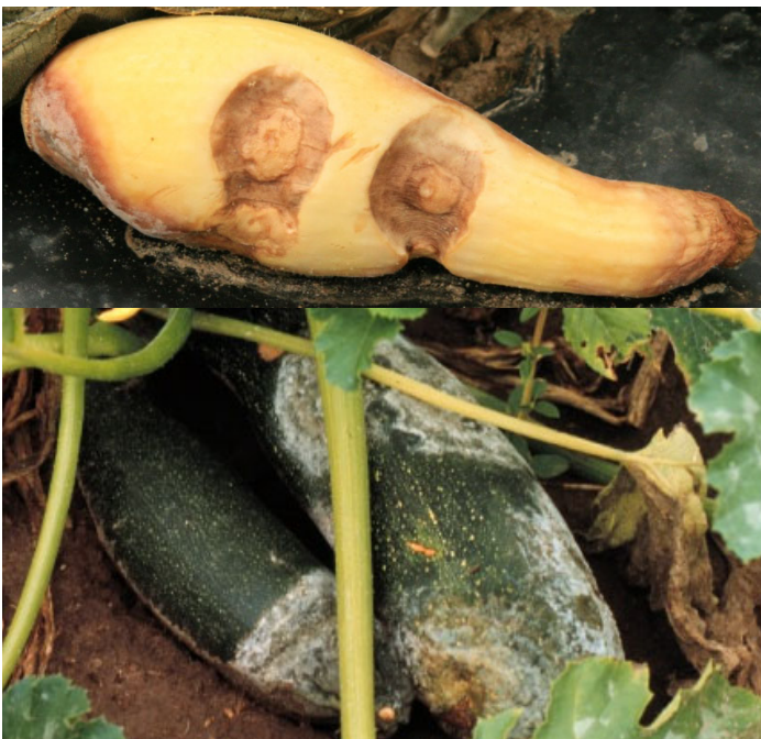
Top: water-soaking and white spores on summer squash. Bottom: white spores on zucchini.

Fungicides can help manage Phytophthora and may need to be applied frequently when weather is wet and conducive to disease.