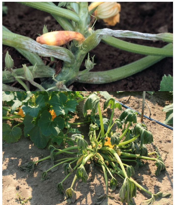
Top: water-soaking of stems and immature fruit. Bottom: wilting of infected summer squash.