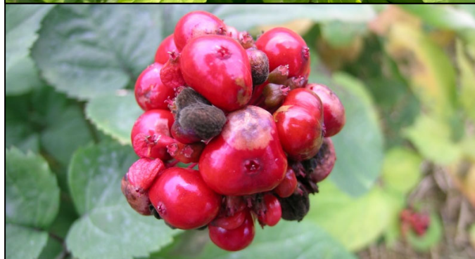
Alternaria on leaves (top) and fruits (bottom).

The potential for repeated widespread and devastating epidemics is great because A. panax produces large numbers of conidia (spores) on the surfaces of diseased tissues. When weather is favorable (humid and wet), blight symptoms and reproduction of the fungus can occur in 5 to 7 days. Outbreaks of Alternaria blight in one season greatly increase the potential for epidemics in subsequent seasons, since the fungus overwinters in the infested plant debris. In the spring, conidia that have overwintered can spread to the newly emerging healthy plants via rain or splashing water and begin the disease cycle for the new growing season.