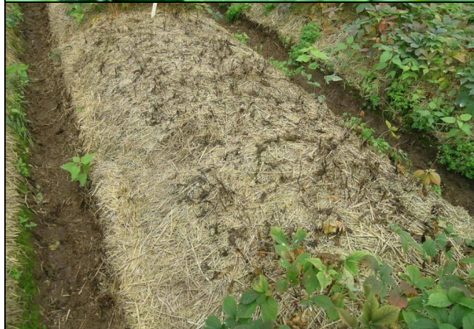
Early onset of Alternaria (top) and dead plants (bottom) as a result of high disease pressure.