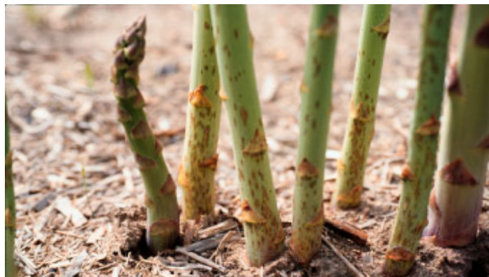
Asparagus spears with purple spot.

The FRAC code is an alphanumeric code assigned by the Fungicide Resistance Action Committee and is based on the mode of action of the active ingredient. When treating for purple spot, rotate among products with different FRAC codes to reduce the possibility of resistance developing in the purple spot fungus.