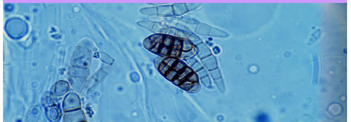
Conidia of Stemphylium vesicarium .