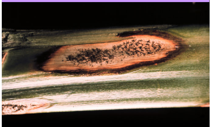
Purple spot lesion with visible spore production.

Following initial infection, the fungus produces multiple spore (conidia) cycles throughout the growing season. These conidia infect plants through wounds and stomata (the pores of a plant used for gas exchange) under wet conditions.