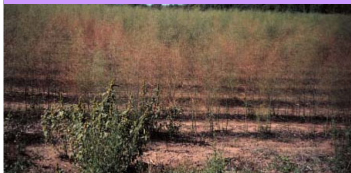
Asparagus field with severe purple spot disease.