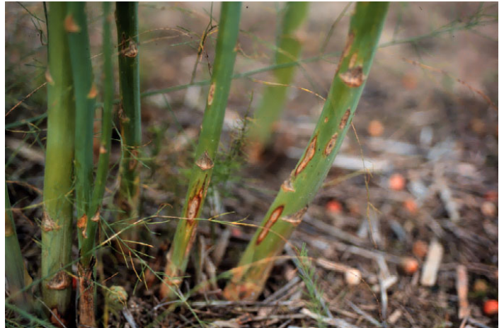
Purple spot on asparagus stems.

The fungus, Stemphylium vesicarium , causes purple spot disease of asparagus spears and fern in Michigan. The sexual stage of the organism ( Pleospora herbarium ) produces overwintering structures (pseudothecia) that contain and release sexual spores (ascospores) in the spring. These structures appear to the eye as small, black dots on fern debris from the previous season. They are responsible for releasing ascospores during rain and causing the primary infection in the spring (see graph, below).