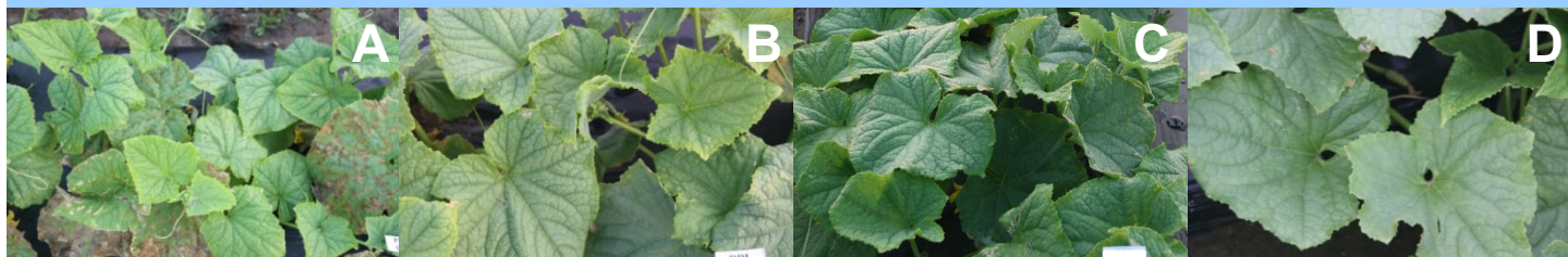
Figure 3. DM on A, untreated cucumber plants, and plants treated with B, Orondis, C, Ranman, and D, Zing!

The Hausbeck Lab continues to evaluate new and existing products annually to determine the most effective fungicide products available for DM control (Fig. 3A-D). Research has found that the DM pathogen may be resistant to fungicides that were once extremely effective.