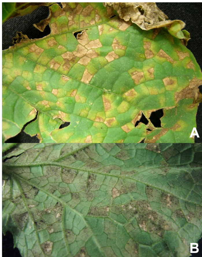
Figure 1. A. Top side of cucumber leaf with yellow lesions and necrosis defined by the veins. B. Underside of cucumber leaf displaying dark fuzzy spore masses.

To help achieve early detection of airborne spores, volumetric spore traps (Fig. 2A) have been placed in Michigan counties during the growing season. Spore traps continuously sample the air and collect spores by imbedding them on a film that is removed